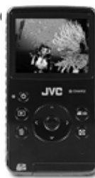
Image stabilization and an 8mp digital still mode really set this camcorder apart from other cameras of its kind. The JVC Piccio GC-FM1 accepts SD or SDHC memory cards so there's virtually no limit to the amount of video and still images that can be recorded without downloading to a computer. At just 5.5" wide and 4.25" high with an above water weight of less than 1.25 lbs, this video package is as light and easy as you'll find anywhere. $460.

Dive into underwater videography with the JVC Piccio, an incredibly compact and simple to use package. The Compact Video housing is high quality, built to last and backed by Ikelite's long-standing reputation for excellence. A full line of accessories allows you to really get creative with your underwater video. All camera controls are fully functional through the housing and depth rated to 200 ft. Easy open drop in camera loading make set-up a breeze. Housing includes a tube of silicone lubricant, vinyl lanyard and removable UR/Pro color correcting filter for tropical blue water settings.